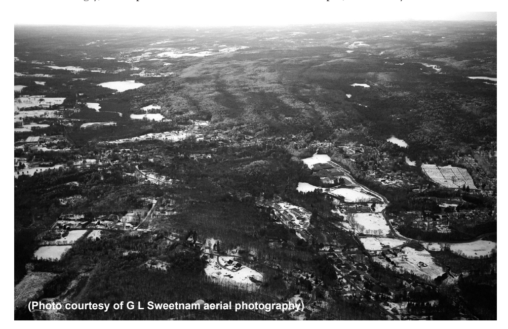
Leslie Sweetnam's aerial view shows the large unfragmented forest block at Bull Hill. The farms of Woodstock are to the west; the Quinebaug River and West Thompson Dam are to the east.

"The view we acquired is spectacular," said board member Jeff Stefanik. "You can see all of Woodstock below you; and you can see down to Bay Mountain in Griswold, Chestnut Hill in East Killingly, Thompson Hill with the white church steeple, all the way over to Wood