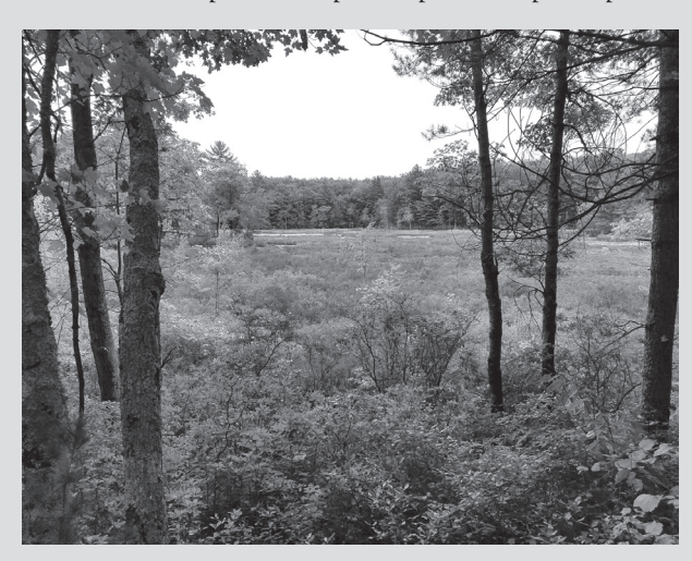
The Long Pond acquisition protects an ecologically

The acquisition was aided by Audubon Connecticut's Wetland In-Lieu Fee (ILF) program—a new funding source aimed at protecting wetlands in the state. The ILF program is an innovative public and private partnership that provi-