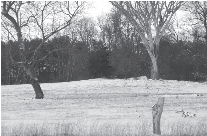
The new Harvey Preserve protects the rural gateway into Woodstock

The donated land contains a pond, some shrubby thickets, and some scattered larger trees. American Kestrels, a state-threatened species in Connecticut, successfully nested there in the summer of 2013. It is the land trust’s intent to keep the fields in agricultural use, and the combination of the two preserves along Route 171 helps to protect the rural gateway into Woodstock.