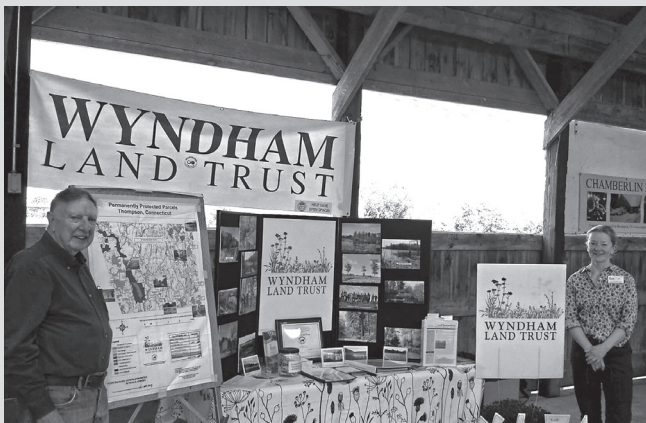
Janet Booth and Rob Tillen at Celebrating Ag

That's about to change. Connecticut DEEP is now working with the land trust to recreate the effect of the beaver dam and to restore the valuable wetlands. The work is expected to be completed in 2020, and we hope the wildfowl will return next winter.