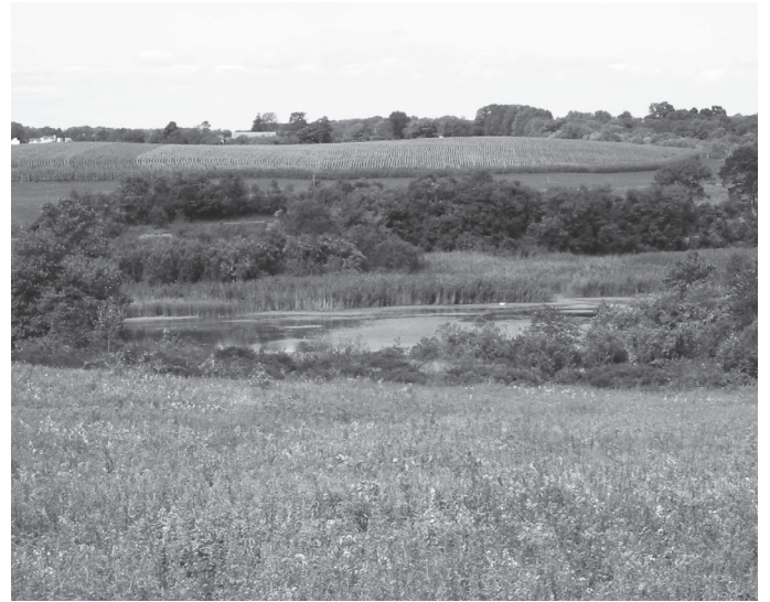
The wetlands at the Duck Marsh in 2007 before a storm destroyed the beaver dam.