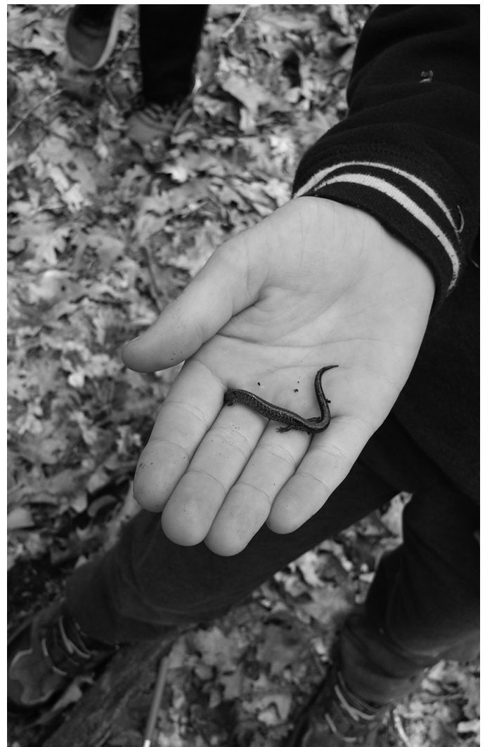
Marcy Dawley led a Last Green Valley Walktober walk to the Rapoport Preserve in Woodstock, where participants searched for salamanders in the leaf litter.