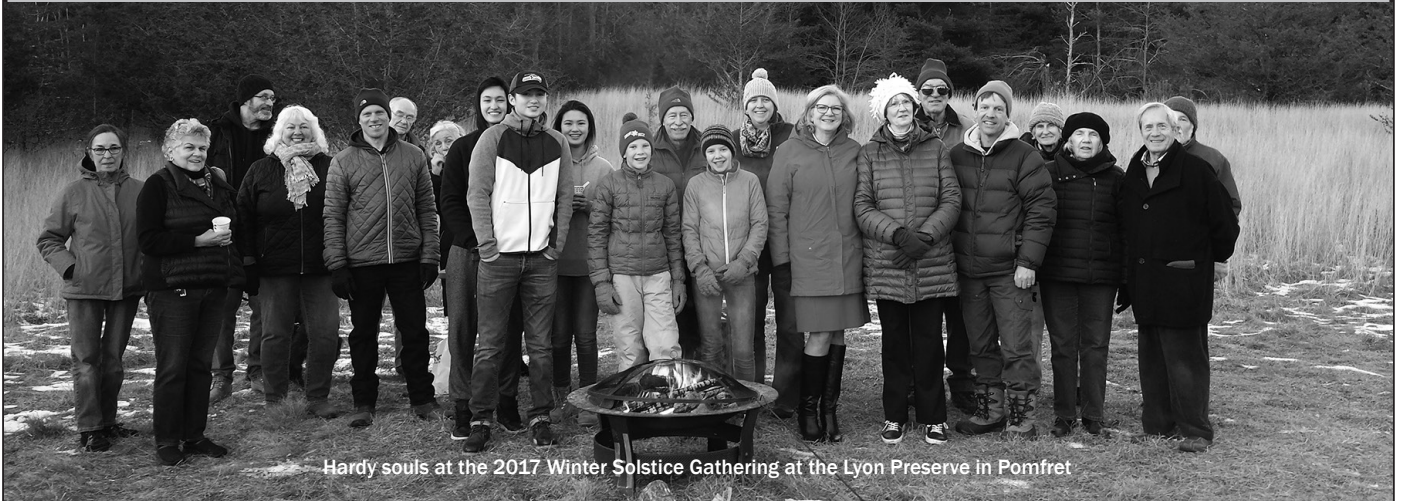
Hardy souls at the 2017 Winter Solstice Gathering at the Lyon Preserve in Pomfret

Please join us at the Lyon Preserve in Pomfret on the afternoon of Saturday, December 21, to watch the sun set on the shortest day of the year. Warm up by the small fire with some hot chocolate and a tasty treat. The event will run from 3–5pm. The Lyon Preserve is on Wright's Crossing Road in Pomfret, just north of the intersection with 101—look for the gate and the land trust sign.