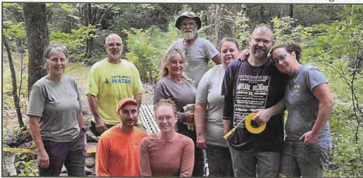
The Bridge Crew