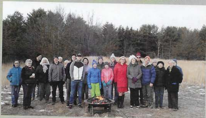
Land trust members watch the sunset at the Solstice event.